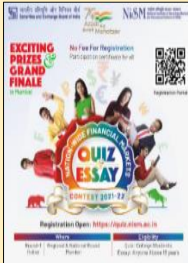
SEBI Nation-Wide Financial Markets Quiz & Essay Contest 2021-22 (click on the image for more details).